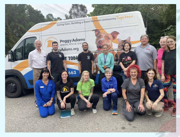
The crew of Peggy Adams Animal Rescue League, UF Veterinary Team, Lake City Humane and SARC staff gather for a picture. Peggy Adams Rescue transported 18 dogs on this day from Lake City!

The University of Florida's Shelter Medicine Program was contacted to help assess the health of all animals, nearly 160, on site. Over 40 cats and kittens were identified for transport to Operation Catnip for spay/neuter and vaccinations. Peggy Adams Animal Rescue League in West Palm Beach helped transfer over 40 dogs and puppies out of the shelter to their adoption facility. Halifax Humane Society of Daytona Beach received 22 of the over 40 cats to help adopt out, while a local Suwannee County veterinarian took 10 more to adopt out! As of December 5, 108 dogs and cats were transferred to pet placement partners in 26 days, reducing the number in the shelter to just 48 dogs and 9 kittens!