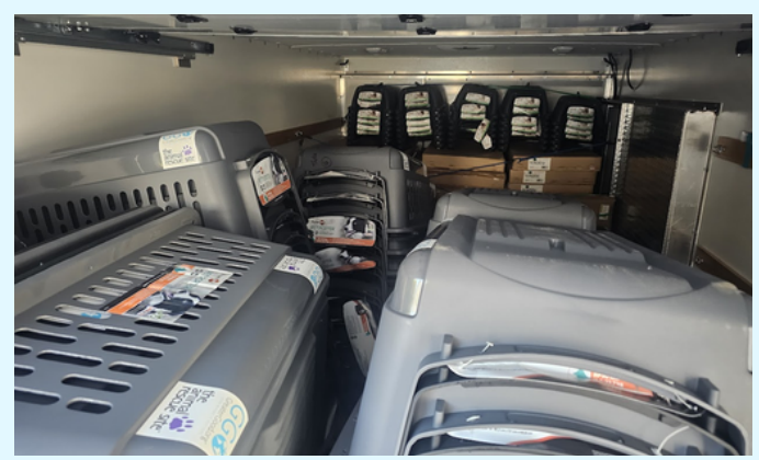
Above: Over 200 wire crates and carriers loaded onto a truck for the Animal Rescue Corp (www.animalrescuecorps.org)

In November, the Bissell Foundation contacted SARC to explore donating disaster response equipment in support of sheltering operations and disaster response in the southeast. This inquiry proved timely, as SARC is currently in the process of relocating equipment from Bushnell, FL, to other locations across the state.