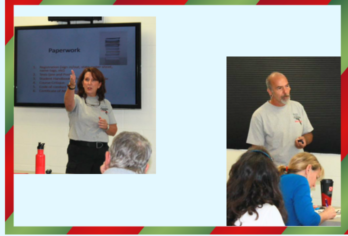
Click HERE for information: <u>https://bit.ly/TTTSARC2024</u>