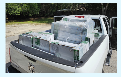
Loaded up for Opelousas, LA - 60+ wire crates

The Animal Rescue Corps, a non-profit organization providing disaster response assistance, had an urgent requirement for crates and carriers. SARC swiftly facilitated the transport of over 200 wire crates to Tennessee. A week later, we coordinated the delivery of 60 airline carriers to a shelter in Baton Rouge, followed bv another consignment of over 60 wire crates to the St. Landry Parish Animal Control in Opelousas, LA, just a few days after Thanksgiving. Our collective efforts resulted in SARC providing more than $47,000 worth of inventory to organizations to support their animal rescue and disaster response initiatives.