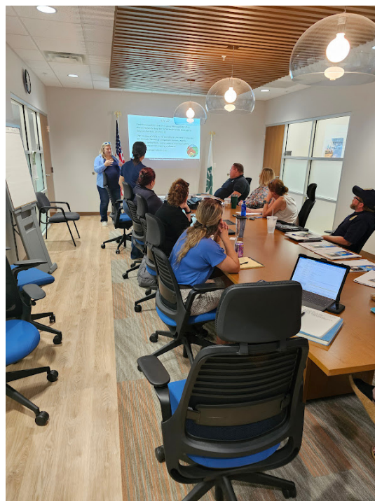
ALACHUA COUNTY, 17 MAY 2023