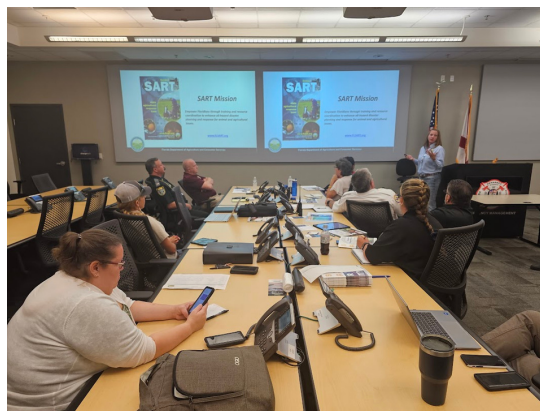
HERNANDO COUNTY, 31 MAY 2023

This will allow local governments to see what their sheltering plan might look like when a disaster or emergency hits. More importantly, it gets YOU, our volunteer base, involved in helping these communities before the big disaster strikes! Stay tuned for more information on this potential opportunity!